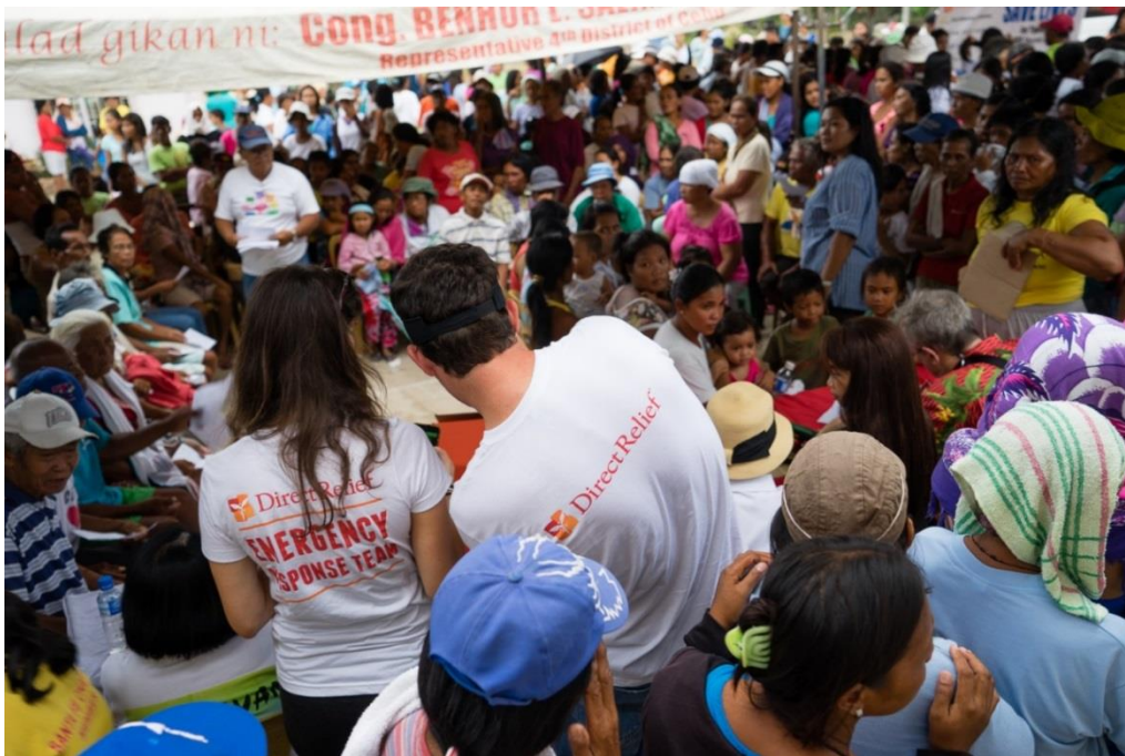
1,000 families turn out for a Direct Relief-sponsored health mission on Bantayan Island

There is still much to do in the Philippines, and Direct Relief is committed to supporting its in-country partners to ensure that long-term recovery is achieved, and health stations in the most vulnerable regions are prepared for the future. Thank you for entrusting Direct Relief with your support to make this work possible.