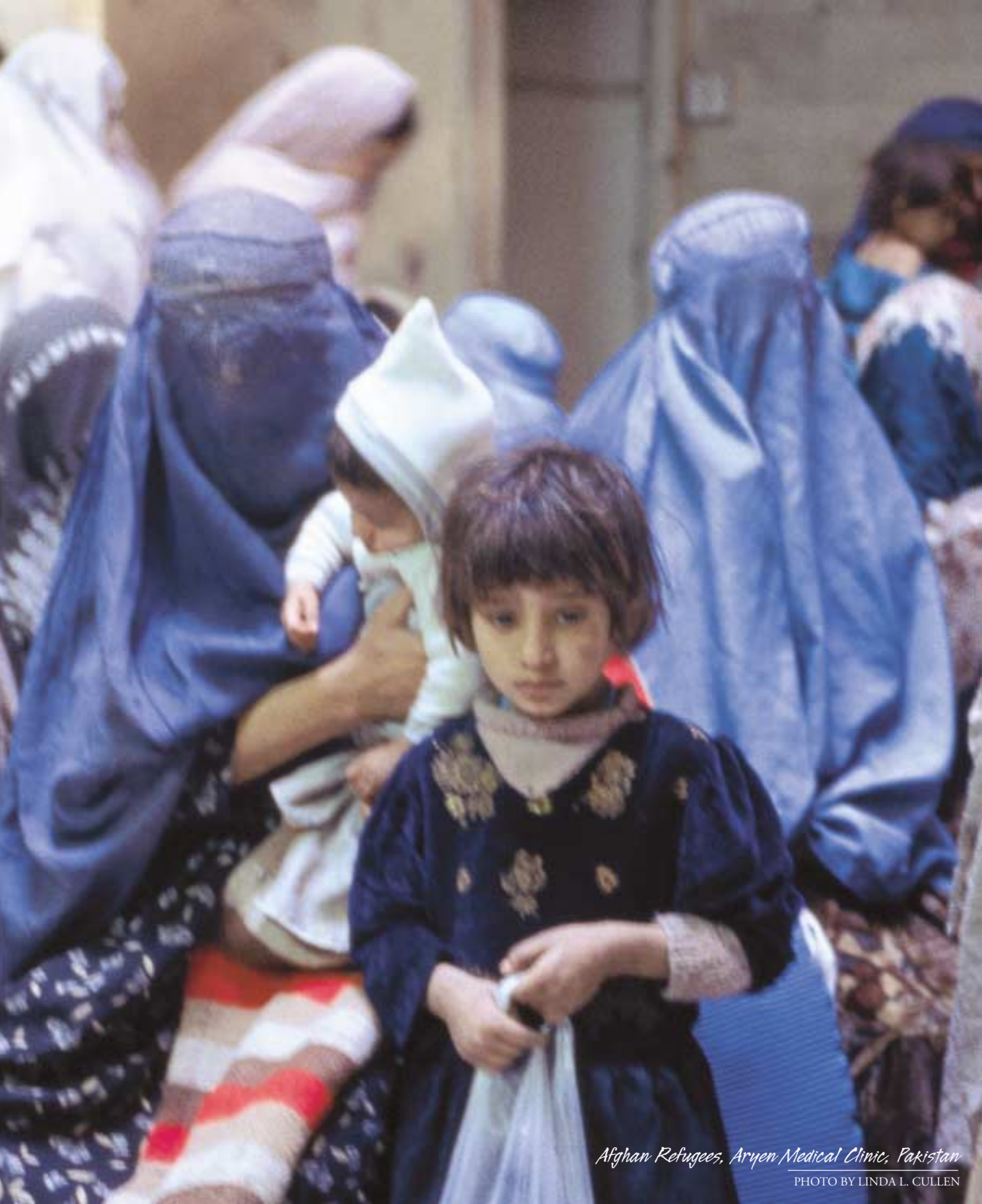
Afghan Refugees, Aryen Medical Clinic, Pakistan