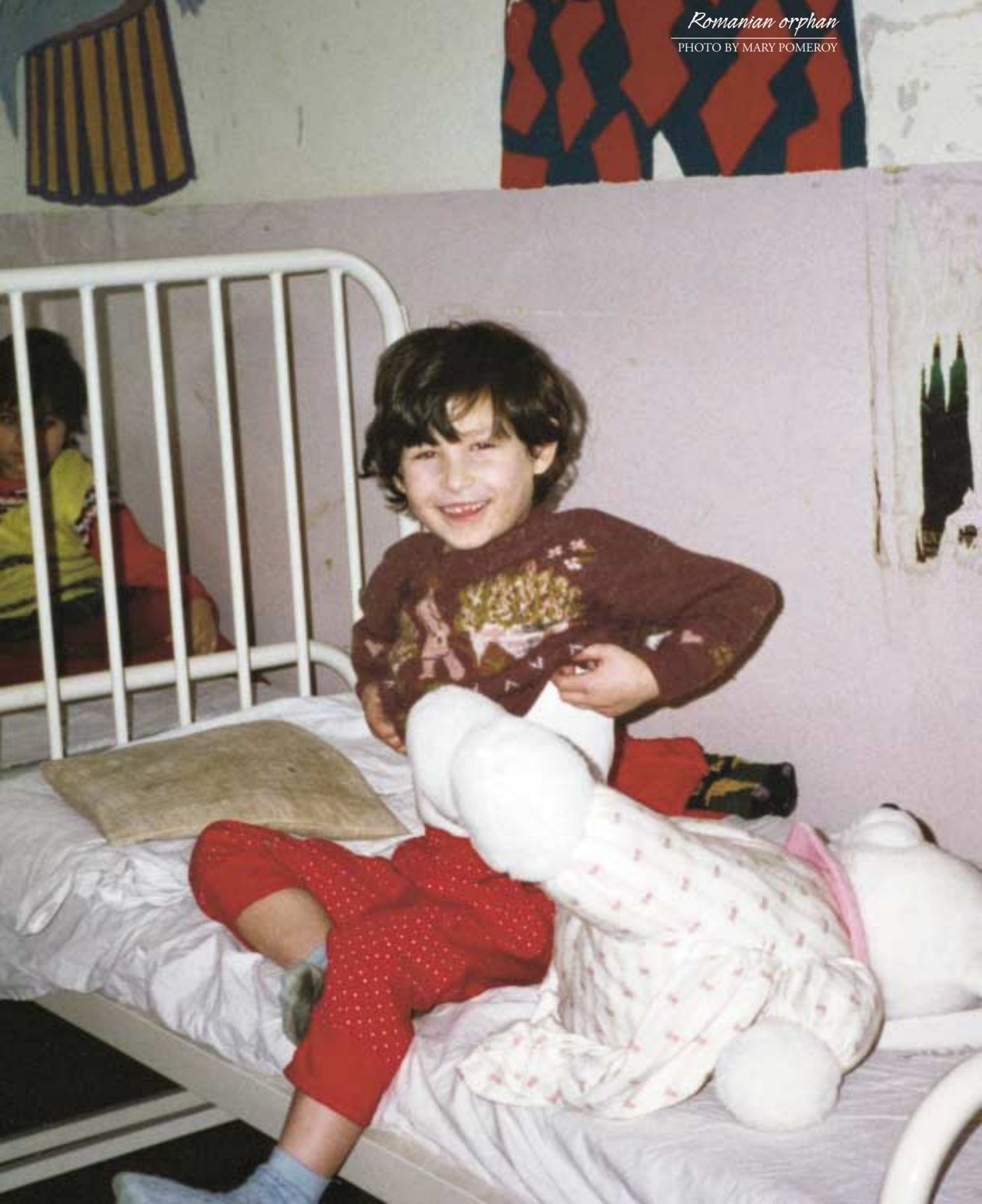
Romanian orphan